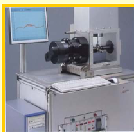
Measuring equipment SRV (friction coefficient)