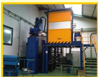
Grease reactor (food grade)

The greases designed and manufactured by Brugarolas have been certified with the NSF H-1 that guarantees their condition of non-toxic (food grade greases) and are considered safe in case of a incidental contact with food. If more information is required, here is the link of the NSF laboratories that has world-wide international recognition. ( www.nsf.org ).